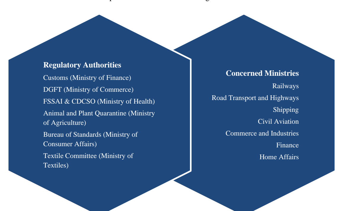
Exhibit 5: Important Stakeholders of the Logistics Division of India<sup>60</sup>

The logistics division had planned on several targets to be completed after coming into full formation such as planning for the IT infrastructure, creating a national information portal and an online market for logistics. The planned logistics division was expected to have a positive outcome on improving the domestic movement of goods through cost reductions, ease of movement and speed generation as well as on contributing towards making Indian-labelled goods highly competitive across the international market.